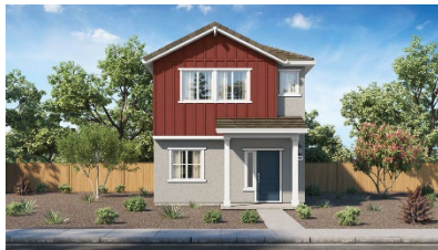
A - Farmhouse

5744 MOLINO CIRCLE, ROSEVILLE, CA 95648 | DRHORTON.COM/SACRAMENTO