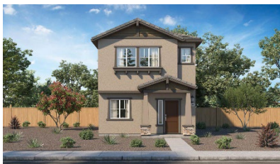
B - Craftsman