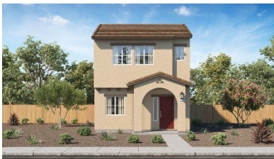
D - Mission