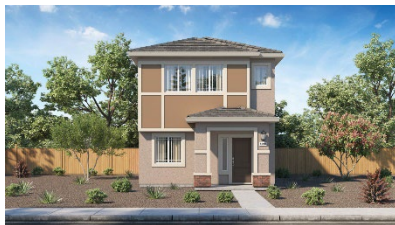
C - Prairie